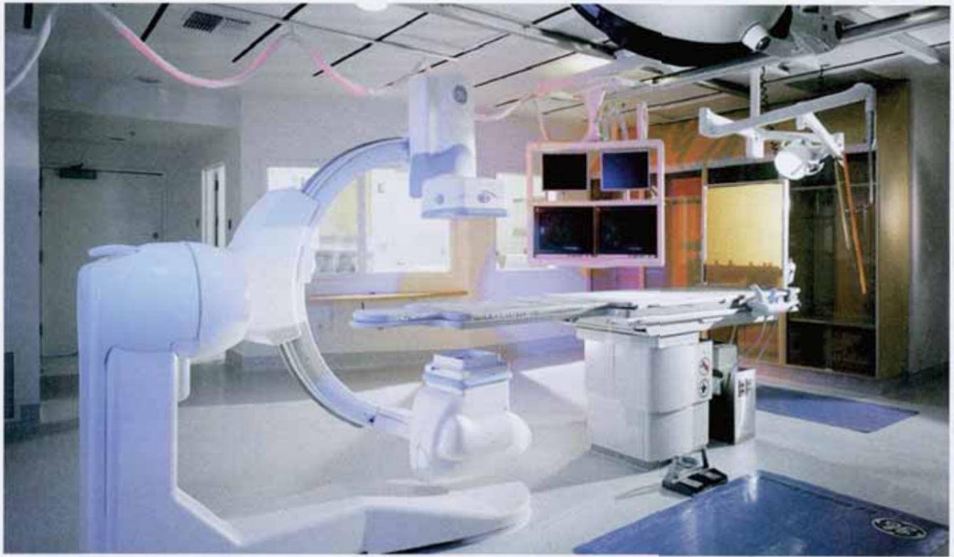
The Irvine Regional Medical Center's cardiac surgery catheterization lab project was fast-tracked through an integrated project delivery approach. The project was completed while keeping the surgery space operational, as the area was sealed off from the rest of the hospital.

also has membership in the American Society for Health Care Engineering, the California Society for Healthcare Engineering, the National Fire Protection Association and the Construction Specifications Institute .