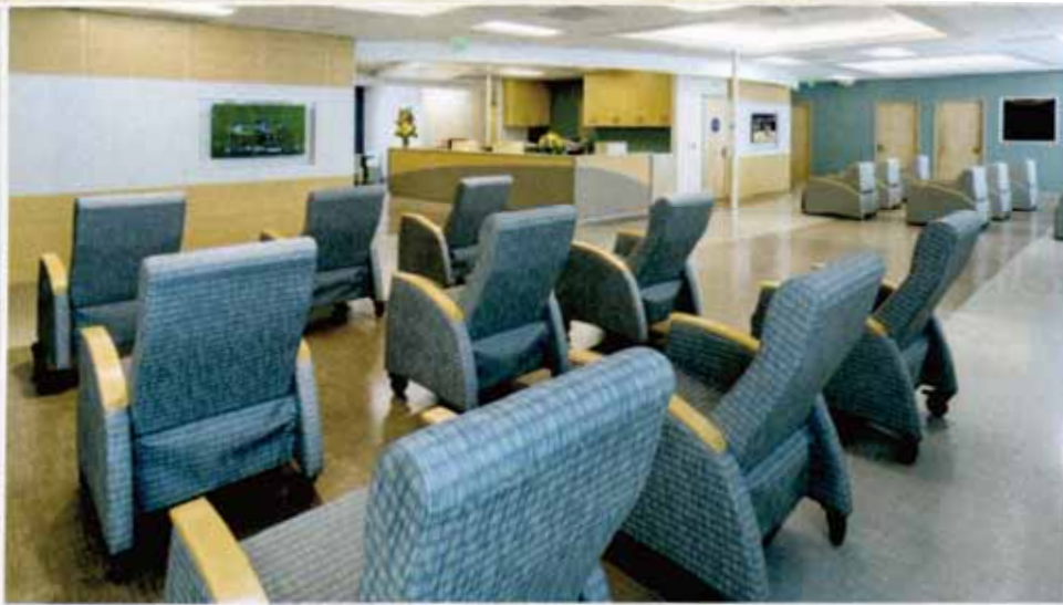
Cornerstone Construction Group, Inc. handled the complete interior and exterior tenant improvement of this 5,000-square-foot locked unit at The Providence Center's Crisis Stabilization Unit.

"We're stable. We've been here for years and we're not going anywhere. Show stability in this industry, and it's good for you and good for your customers."