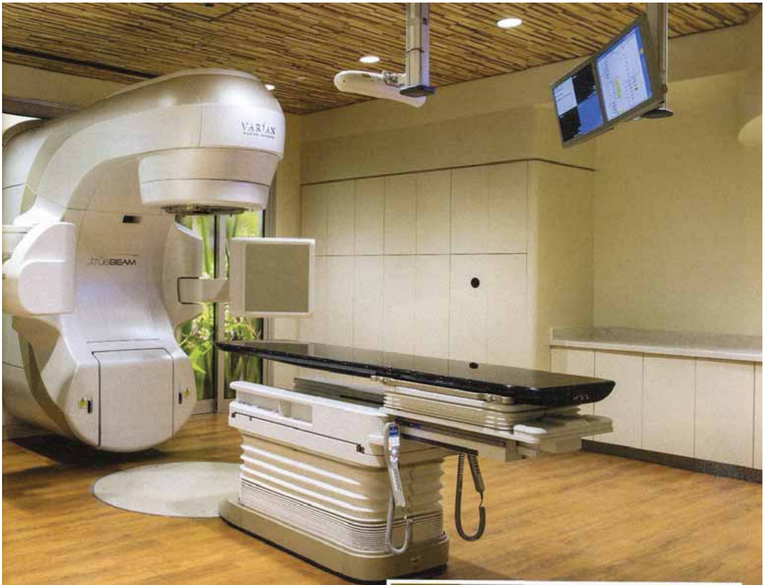
Site prep and replacement of a new linear accelerator for the Providence Del Amo Diagnostic Center included a new vault door as well as structural, mechanical, electrical and plumbing upgrades.

built-in marketplace. I hit the ground running and always had jobs available."