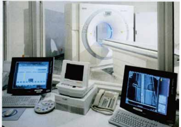
Cornerstone Construction Group, Inc. constructed the East Tower diagnostic imaging center at the Fountain Valley Medical Center.