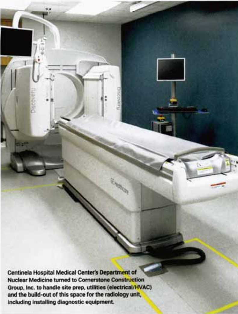
Centinela Hospital Medical Center's Department of Nuclear Medicine turned to Cornerstone Construction Group, Inc. to handle site prep, utilities (electrical/HVAC) and the build-out of this space for the radiology unit, including installing diagnostic equipment.

“Reputation is everything in this business. You’ll get one rapidly, whether you’re good or bad. Once you have a good reputation, your job is to protect it. Do things right and continue to do things right.”